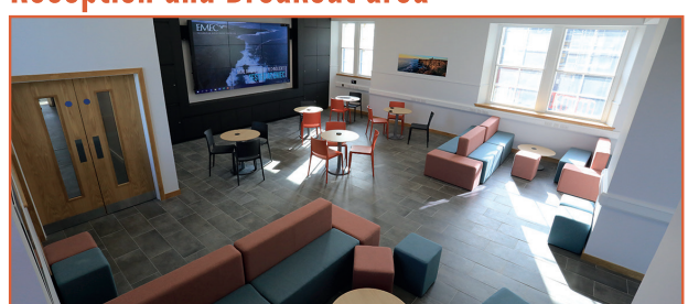
CAPACITY - Up to 50 seated, 75 standing PRESENTATION - Flexible options

3m Video wall with connectivity via the built-in pc or your own laptop or Wolfvision Cynap Pure application. Two-Way Surface Mount speakers with 6.5" Woofer. Multiple phones can connect to the video wall simultaneously.