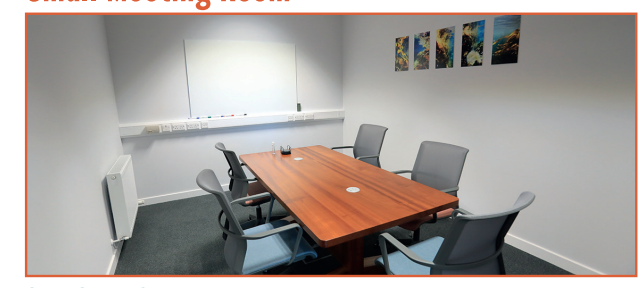
CAPACITY - 6 seated PRESENTATION - 1 boardroom table only